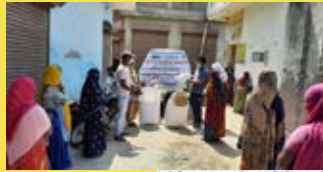
मोबियस फाउंडेशन ने मेयर को मुहैया कराई राहत सामग्री