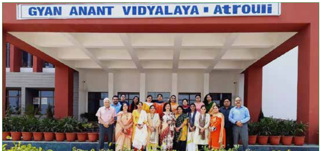
Teachers, Principals and administrative staff of GAV.

We are pleased to announce that school has crossed 100 students mark in 2021-22 session with new batch for class 8 which has started this year. Summative Assessment II examinations, corrections and result tabulation are being completed by 31 March 2021. In the month of April Parents Teacher Meeting, Sale of books and uniform will be scheduled. New session for online classes shall commence from 15th April 2021. The school is undergoing preparation, planning and documentation for CBSE Secondary school affiliation.