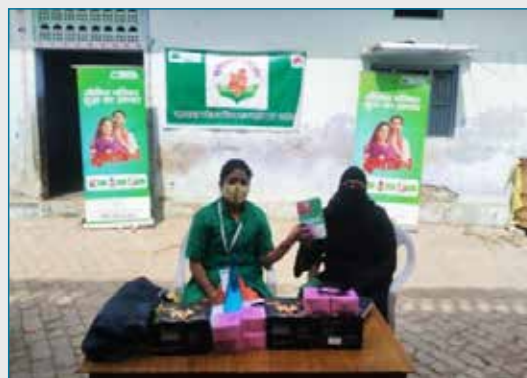
Khushaal Parivar Diwas celebrated at Bahraich and Barabanki districts, UP