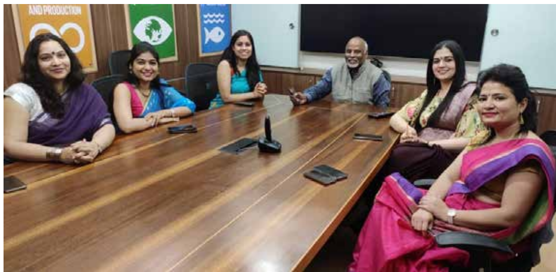
International Women's Day celebrated at Mobius Foundation