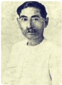
Munshi Premchand Novel writer, Story Writer and Dramatist

सौभाग्य उन्हीं को प्राप्त होता है, जो अपने कर्तव्य पथ पर अविचल रहते हैं।