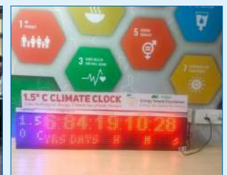
Climate Clock displayed at Mobius Office