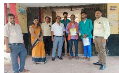
On ground team with NSV beneficiary (center)