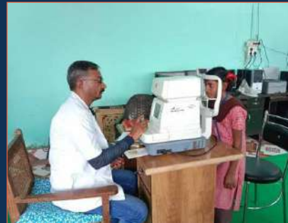
▲ Eye check-up of KGBV students

Madhya Pradesh: A Health Camp was organized at the Government Girls Middle School, Unchehra, Madhya Pradesh on the 30th November 2023 and 2nd December 2023 in collaboration with M.P. Birla Hospital, Satna & Sadguru Netra Chikitsalaya, Chitrakoot. The blood samples of 163 students were collected to check complete blood count, consultations with gynecologist, dietician and ophthalmologist were provided along with an interactive session with infection control officer. The girls with low hemoglobin were prescribed and provided the required dosage of supplements. Free of cost frames and eye drops were distributed and girls diagnosed with refractive error in vision and amblyopia have been referred to Sadguru Netra Chikitsalaya, Chitrakoot for further investigation and free of cost treatment.