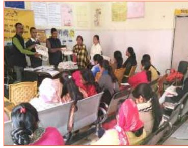
▲ Asha Cluster Meeting

Project Umeed, under Aakar, in Jarwal block showcased extensive efforts towards population stabilization through awareness sessions, health melas, and family planning activities. A Block Coordination Committee is formed, as well as events are organized in the district. Additionally, a comprehensive approach is exhibited by effectively engaging a wide range of stakeholders, utilising visual aids, and expanding outreach efforts. Overall, the initiative is moving forward, with an emphasis on reproductive choice.