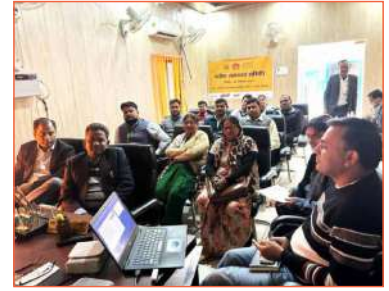
▲ Block Coordination committee, Jarwal, UP meeting