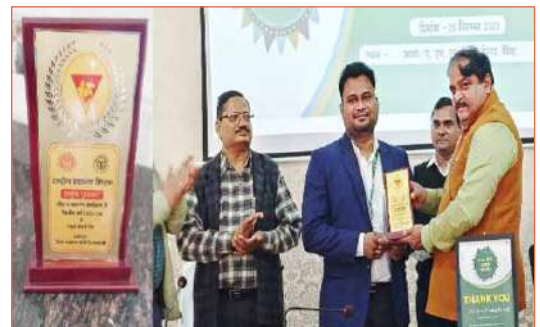
▲ District Health Society awarded Mobius Foundation for outstanding performance in family planning programme

As part of the project Aakar, Champion Maa Baap achieved significant milestones. The project concluded NSV Fortnight and organized the Asha Samman Samaroh to honor Asha workers. The Samaroh facilitated over 200 Asha workers. Furthermore, successful mobilisation efforts of the project resulted in 7 NSVs, 100 FSTs, 6 Antara, and one IUCD client in Bahraich and Shravasti districts of Uttar Pradesh. The Mobius Foundation also received an award for outstanding performance in Family Welfare in Shravasti, Uttar Pradesh.