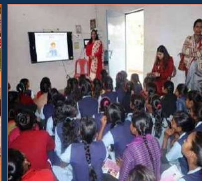
▲ Health camp at Government Girls Middle School, Unchehra, Madhya Pradesh