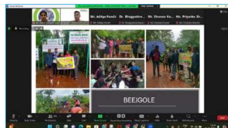
Online Pre-ICSE Forum organized by Mobius Foundation and Climate Reality Foundation

For more information, please visit our website: https://www.icse-esd.org/youth-for-earth-2024.php