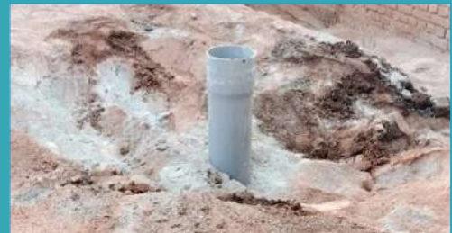
▲ Borewell dug at Govt. Girls Higher Secondary School, Gunnaur, Panna, MP