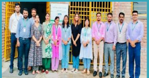
▲ Training session conducted by Lotus Petal Charitable Foundation at Dhunela, Gurugram