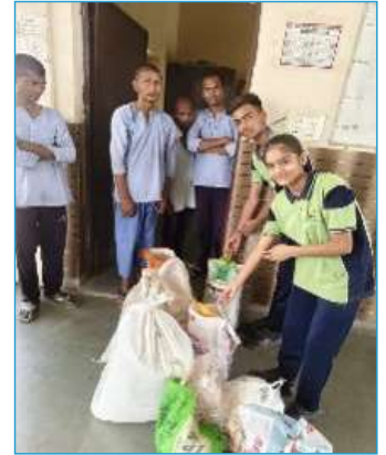
▲ Visit to Old age home

The students of GAV visited an old age home in Pilkhuwa and Hapur as part of our food donation drive. This initiative is a step towards achieving the SDG 2 of Zero Hunger .