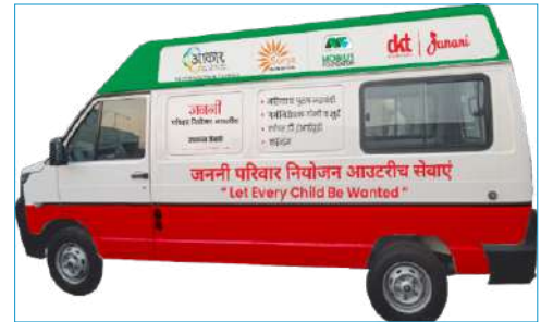
Project Aakar van equipped equipped with dedicated Community Outreach Team and laparoscopic instruments