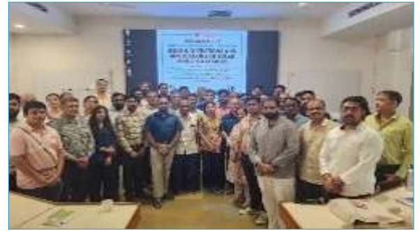
Attendees of the training program